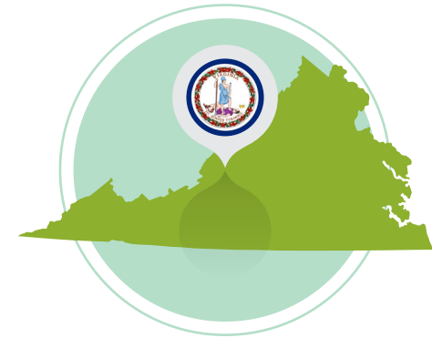
Virginia 8,631,393 | 7.9% ▲

The final census data showed significant population increases from 2010 to 2020 of 14.6% for DC, 7.9% for Virginia and 7.0% for Maryland (compared to an overall increase of 7.4% for the U.S.).