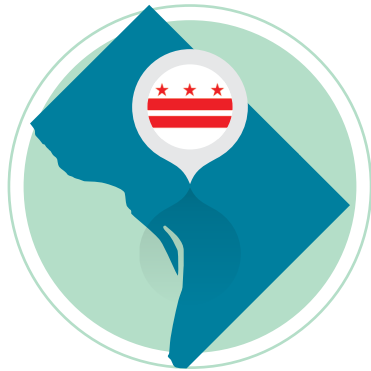
District of Columbia 689,545 | 14.6% ▲