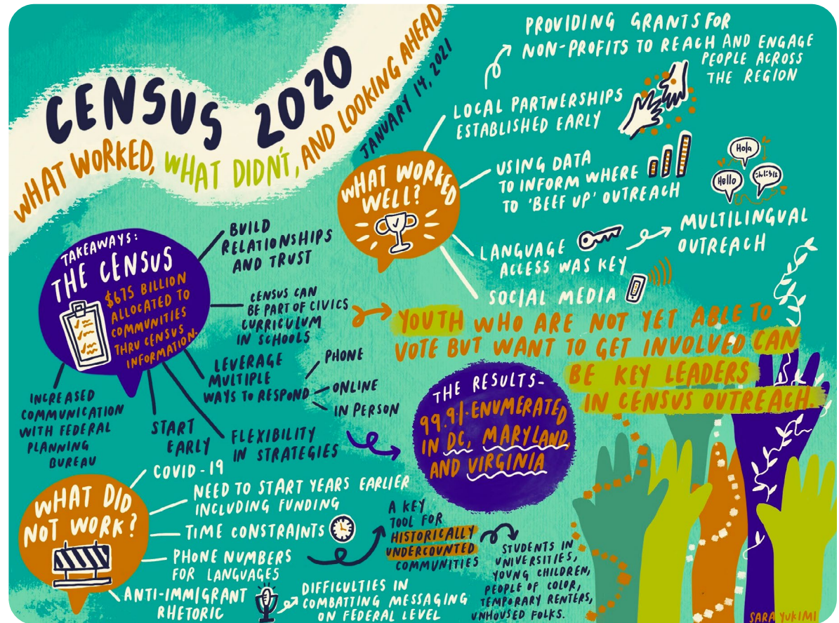
PHOTO CREDIT: Census 2020: What Worked, What Didn't and Looking Ahead January 2021 Convening. Graphic recording Artist Sara Yukimoto-Saltman