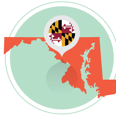
Maryland 6,177,224 | 7.0% ▲